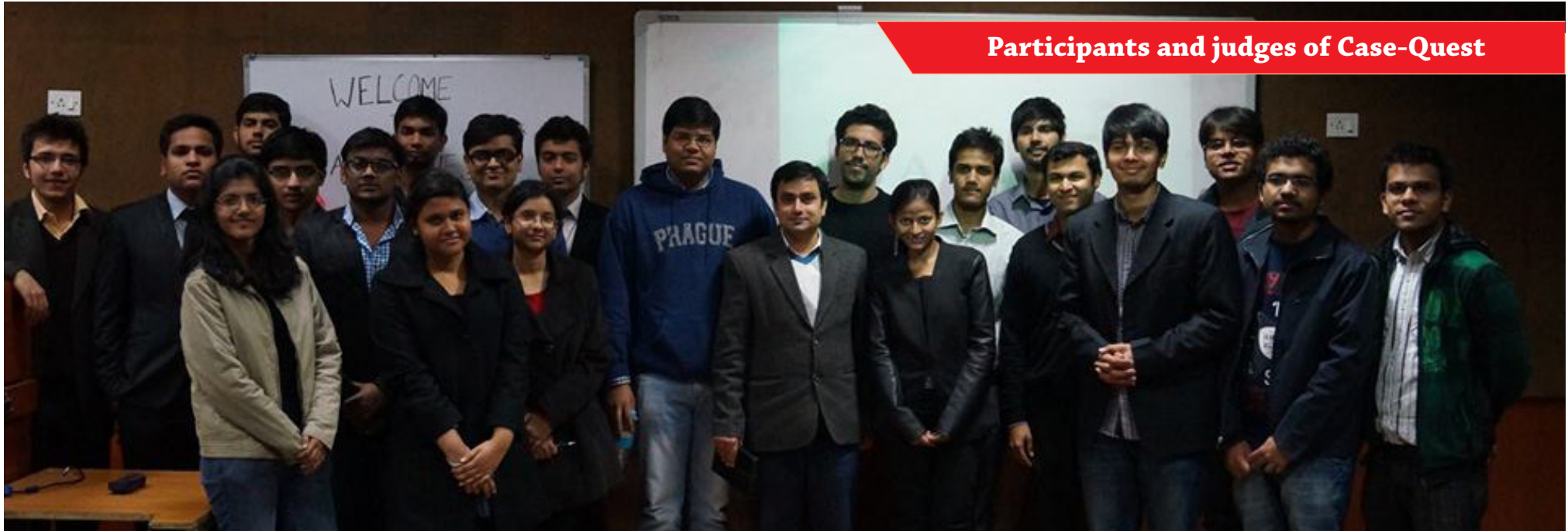
Participants and judges of Case-Quest