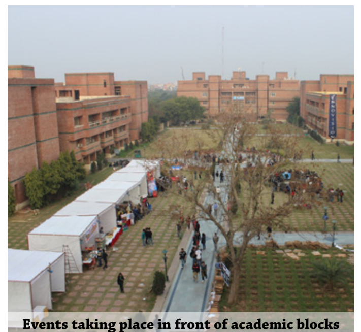
Events taking place in front of academic blocks