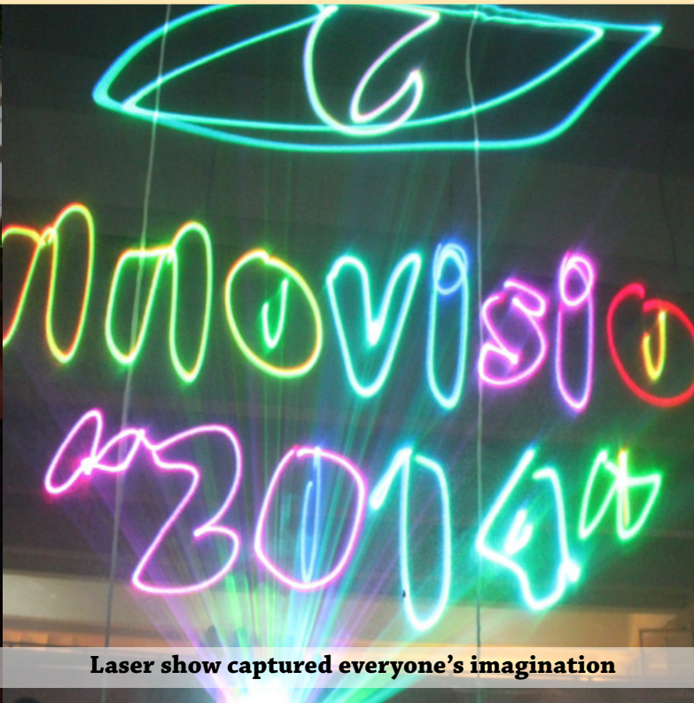
Laser show captured everyone's imagination