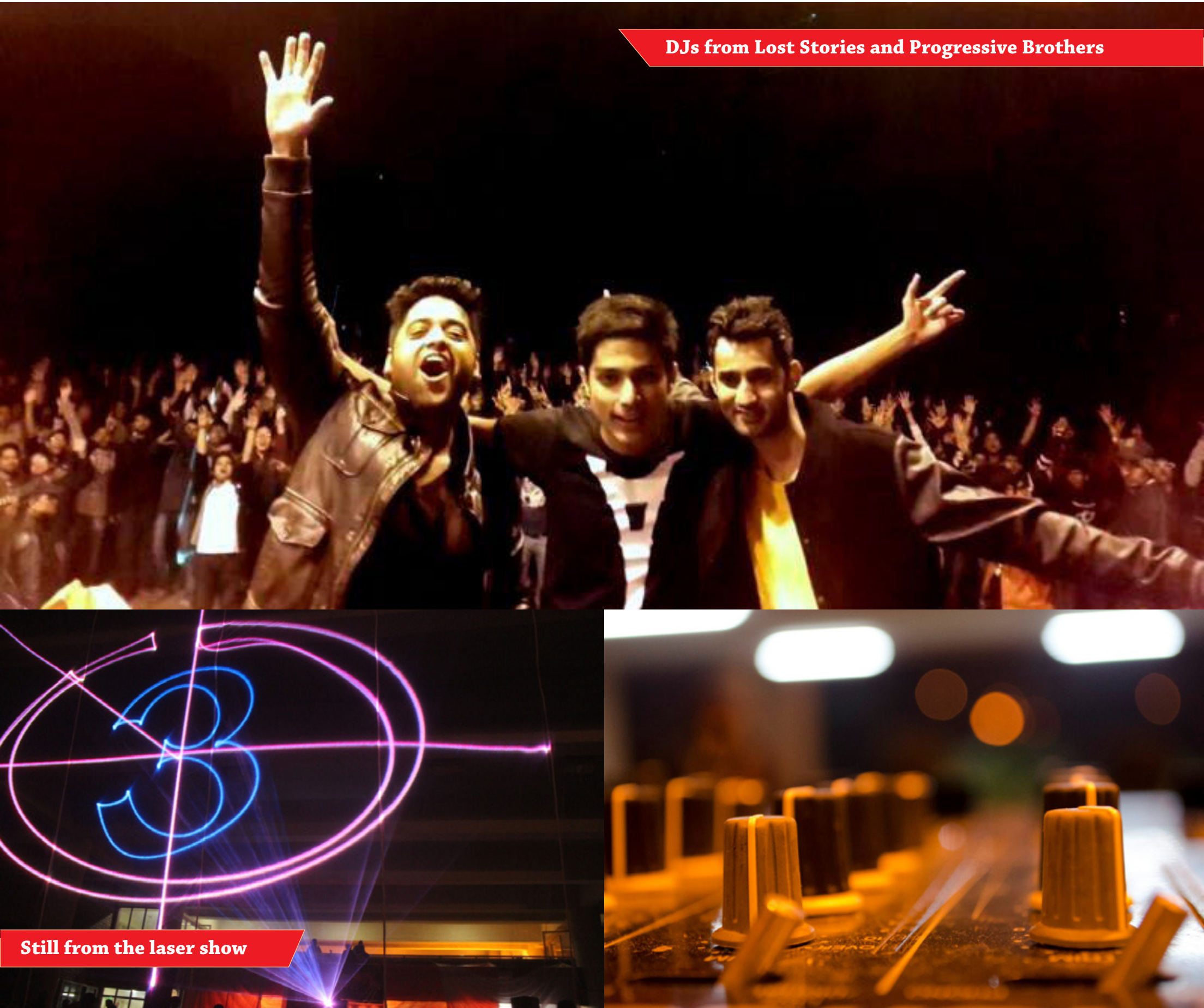
DJs from Lost Stories and Progressive Brothers