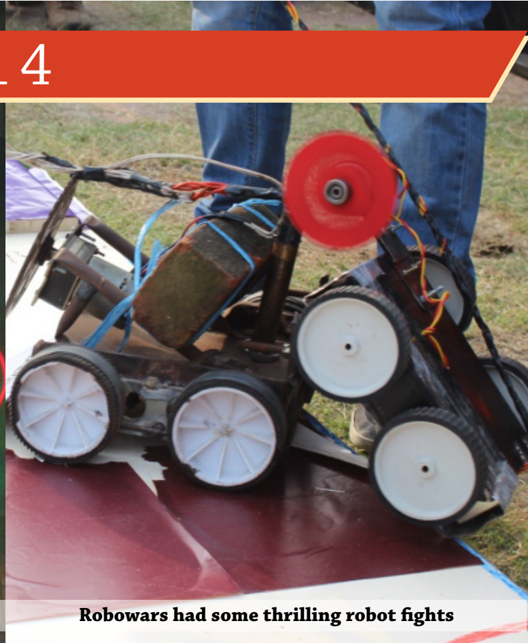
Robowars had some thrilling robot fights