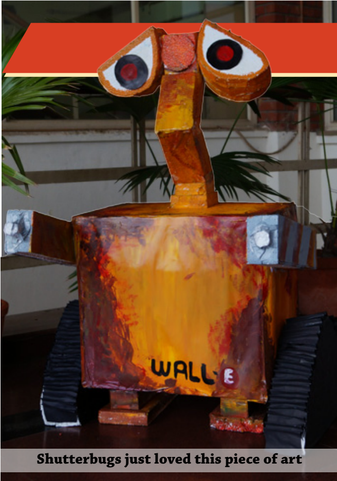
Shutterbugs just loved this piece of art