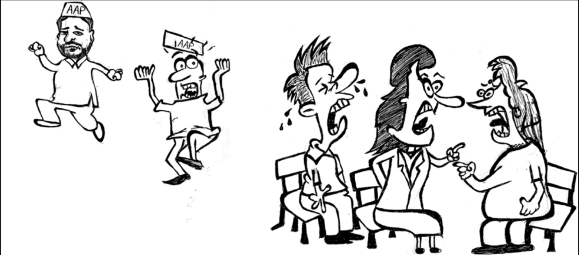
Chasing the Panelists